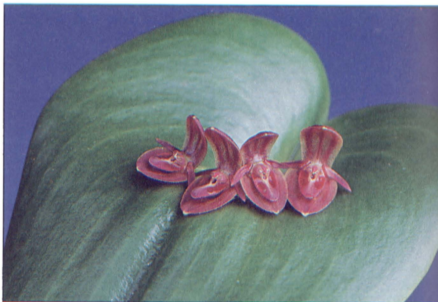
9. PLEUROTHALLIS FOSSULATA Luer & R. Escobar. Cultivo: Colomborquídeas